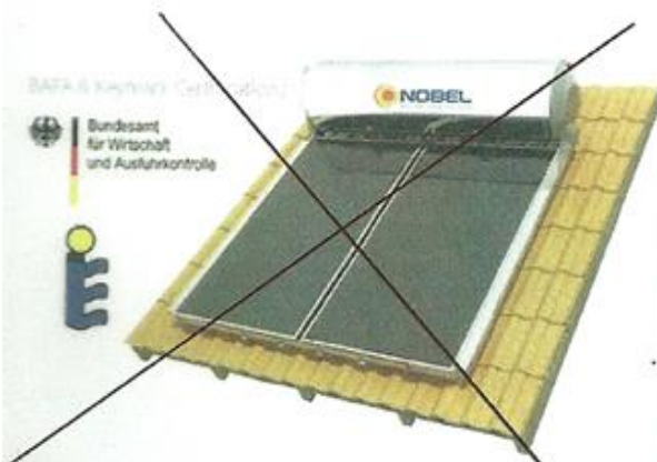
320L NOBEL Indirect Solar Geyser