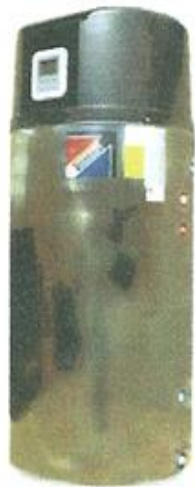
SA Heat Pump Integrated SHPI 200LE/250LE/300LE/400E